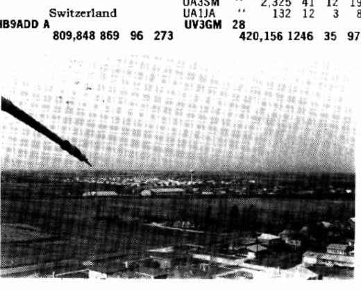
We see many photos looking up at beams and towers but here's one looking from the top down. It was taken from the "crow's nest" at the 120 ft. level of W9EXE's tower.

VK2WD A 38,790 153 29 4 VK2APK 14 447,262 1030 36 11 VK2BNK " 12,544 72 23 4