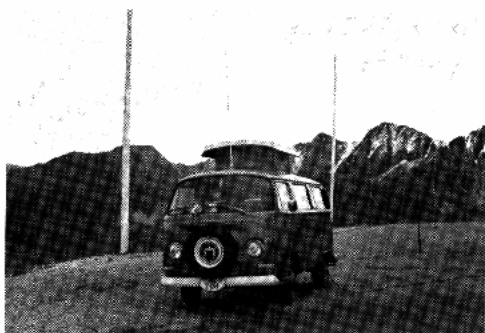
The fixed mobile location of C31CQ and the camper used by K2IXP high in the mountains of Andorra. Larry experienced freezing temperatures at this 8500 ft. altitude.

The call 9Y4AA may be new but not its operator. Jim Neiger, ex-ZD8Z again had the extra QSO point advantage for all those W/K contacts and nosed out Herb, KV4FZ for top honors.